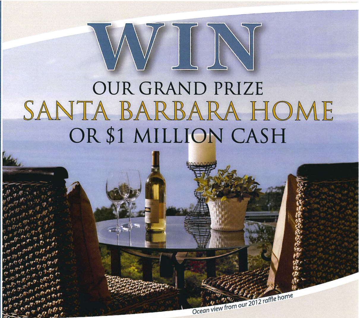
Ocean view from our 2012 raffle home